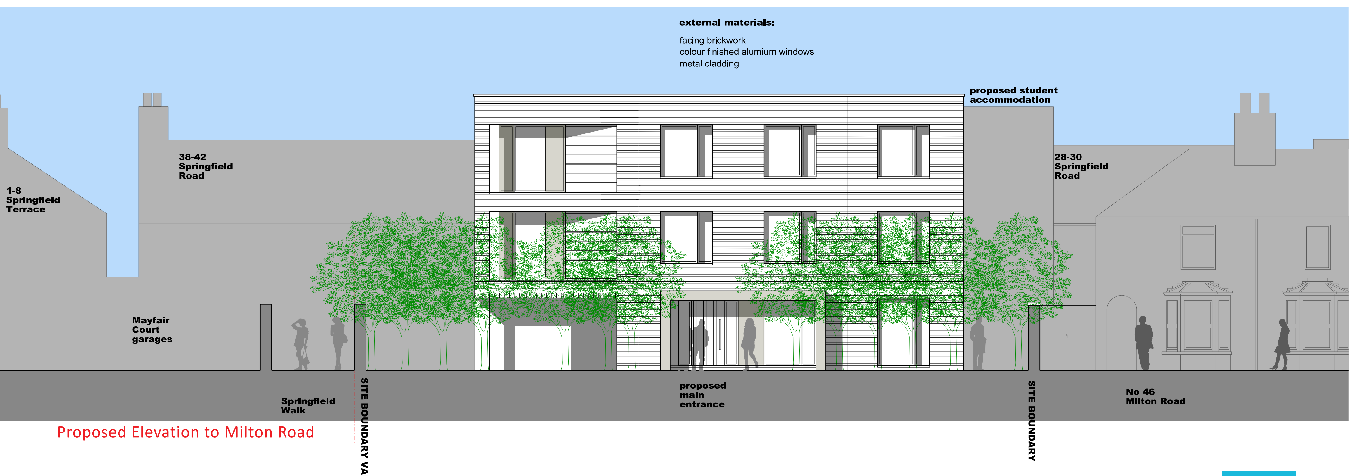
Proposed Elevation to Milton Road