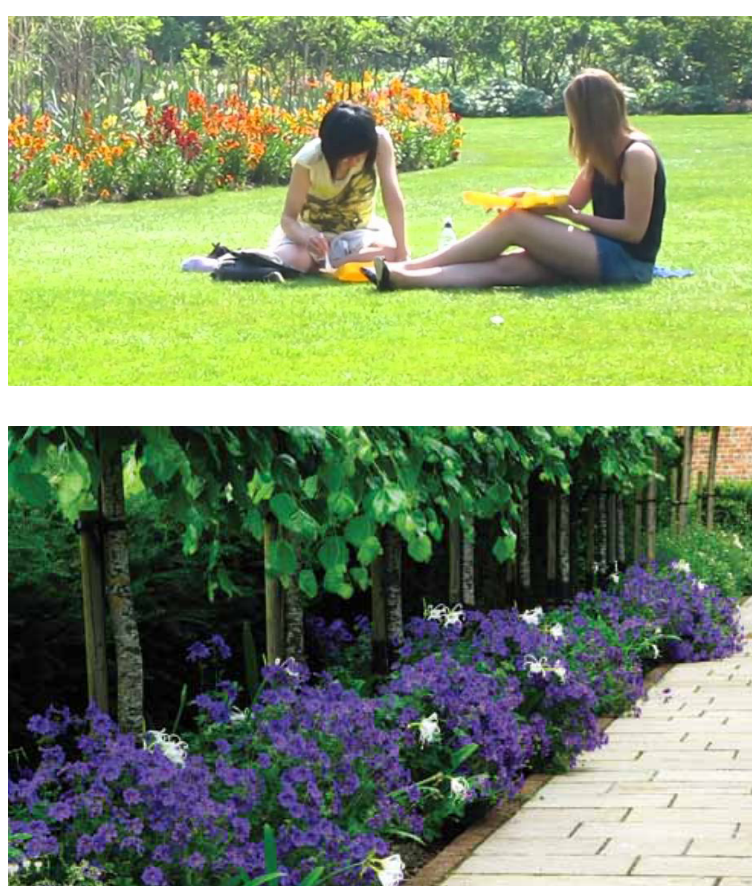
Proposed landscaped walled garden will provide an attractive setting to residents.