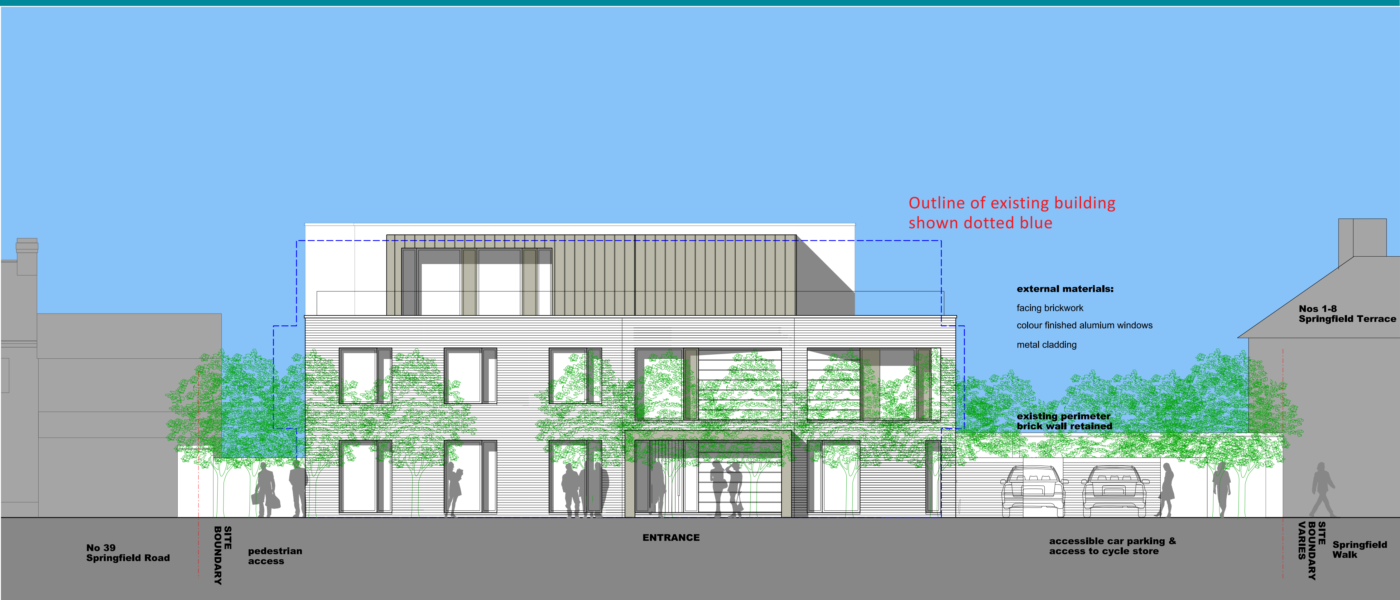
Proposed Elevation to Springfield Road